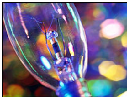
Ban the bulb? Australia plans to switch to fluorescent light by 2010

Australia has announced plans to ban incandescent light bulbs and replace them with more energy efficient fluorescent bulbs.